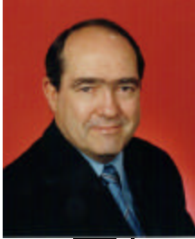
SENATOR ANDREW MURRAY AUSTRALIAN DEMOCRATS ACCOUNTABILITY SPOKESPERSON