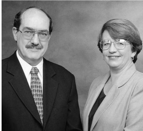
Senator Andrew Murray with Australian Democrats' Leader, Senator Meg Lees.